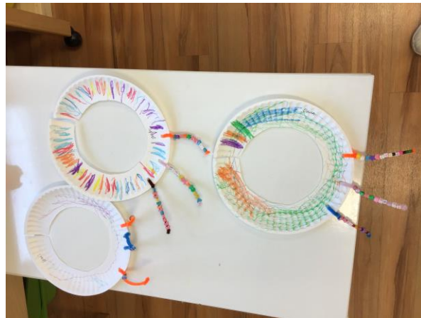
Our classroom dream-catchers!

We are visiting the Middle East this week! Since we only have a week we won't get to explore every single country, but we are trying to see as many places as we can. Here's to an amazing week full of adventure!