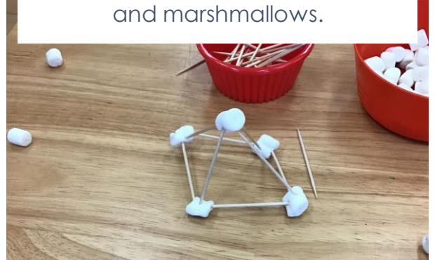
Building pyramids using toothpicks and marshmallows.