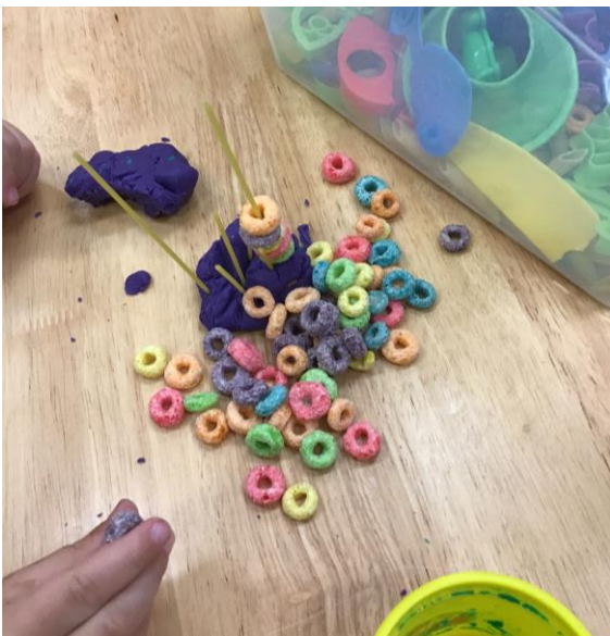
Getting creative with our building materials as we work on our fine motor skills.